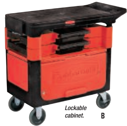
Lockable cabinet. B