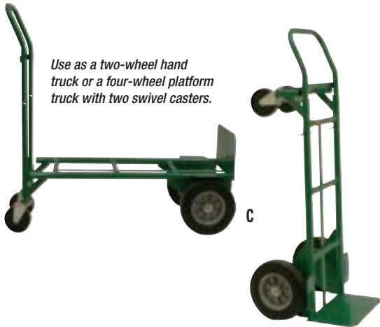
Use as a two-wheel hand truck or a four-wheel platform truck with two swivel casters.