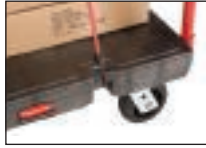
Molded-in tie down slots allow use of straps or bungees.