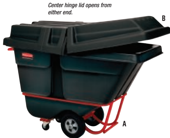
Center hinge lid opens from either end.

† Utility-duty tilt trucks do not include frame