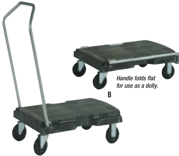
Handle folds flat for use as a dolly.