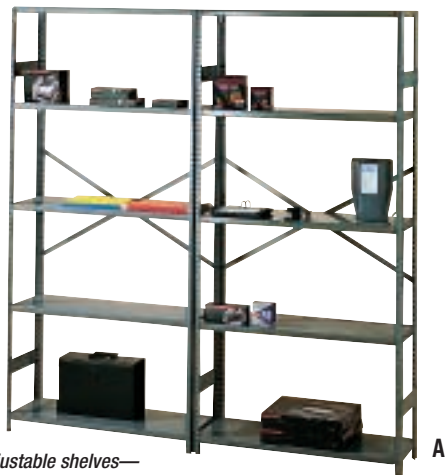
Adjustable shelves— includes posts and clips.